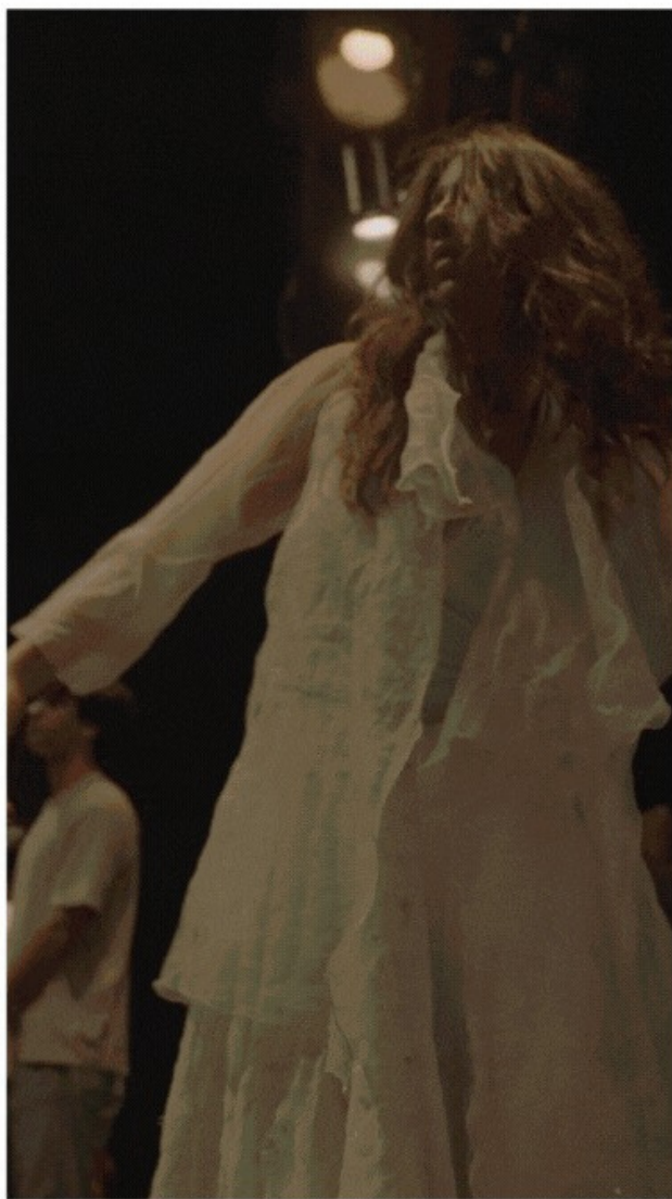
Museum of Emotions Performance Bulgaria