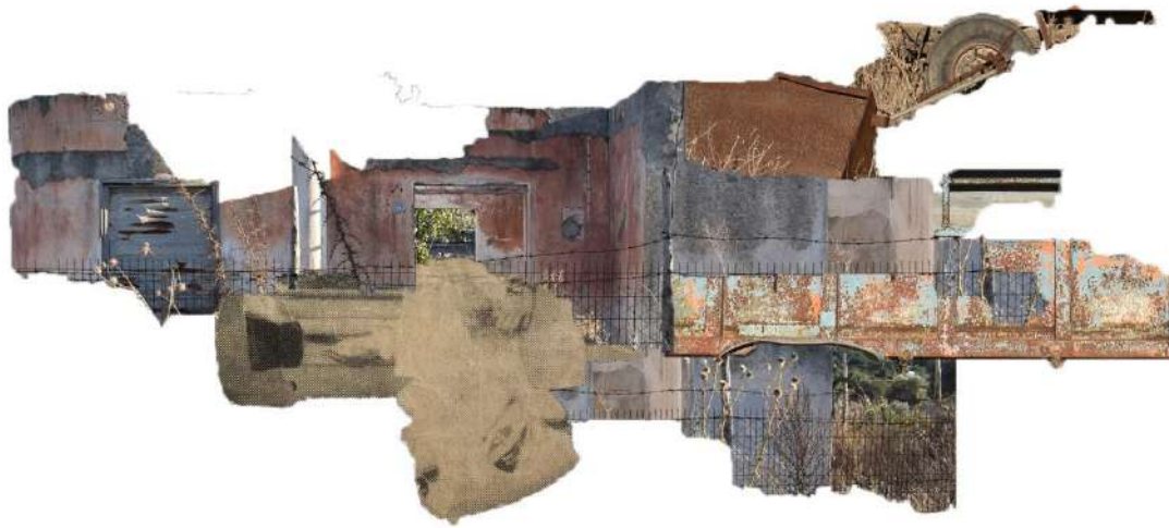
Untitled, 2021, digital collage, 115 x 100 cm