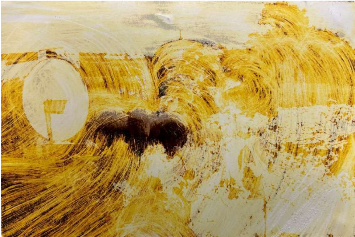
Untitled, 2022, photograph, 15 x 10 cm