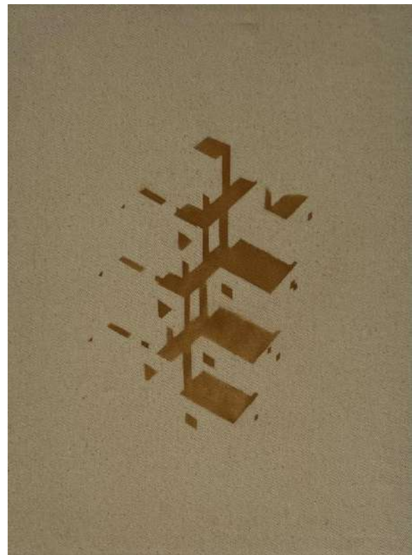
Untitled, 2022, soil, 40 x 30 cm