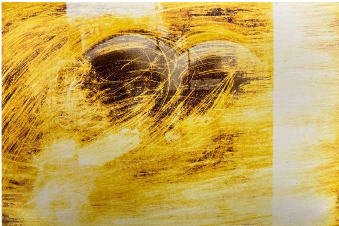
Untitled, 2022, photograph, 15 x 10 cm