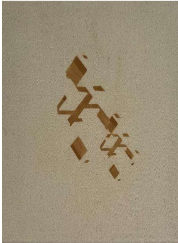
Untitled, 2022, soil, 40 x 30 cm