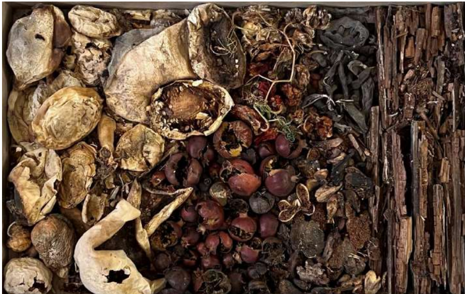
Untitled, 2022, fruitage, 100 x 75 cm