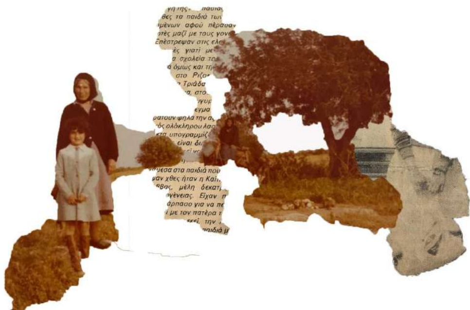
Untitled, 2021, digital collage, 115 x 100 cm