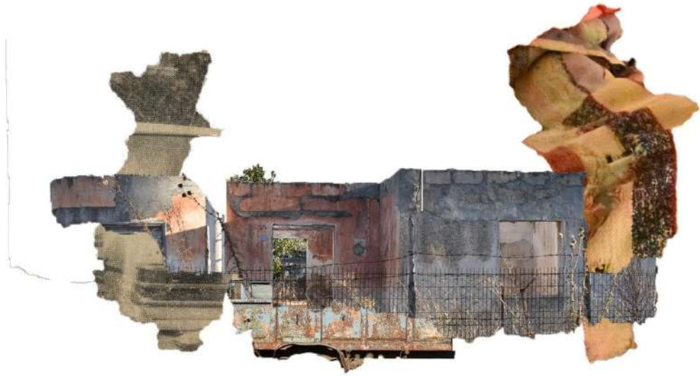
Untitled, 2021, digital collage, 115 x 100 cm