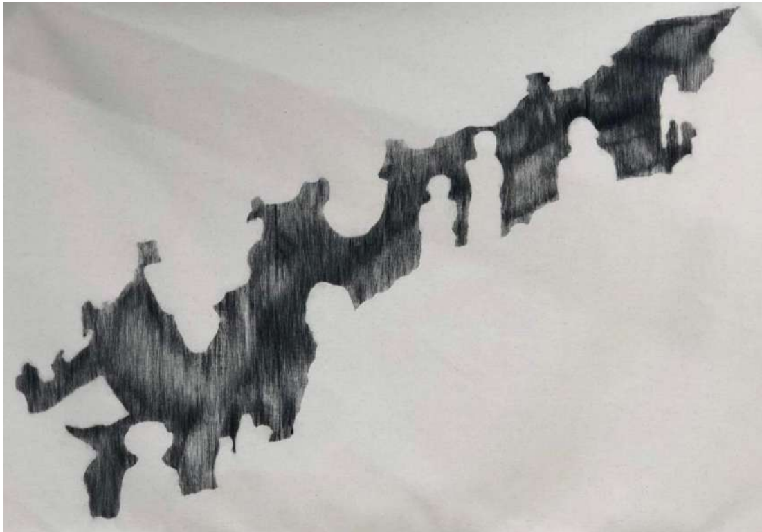
Untitled, 2021, charcoal, 100 x 70 cm