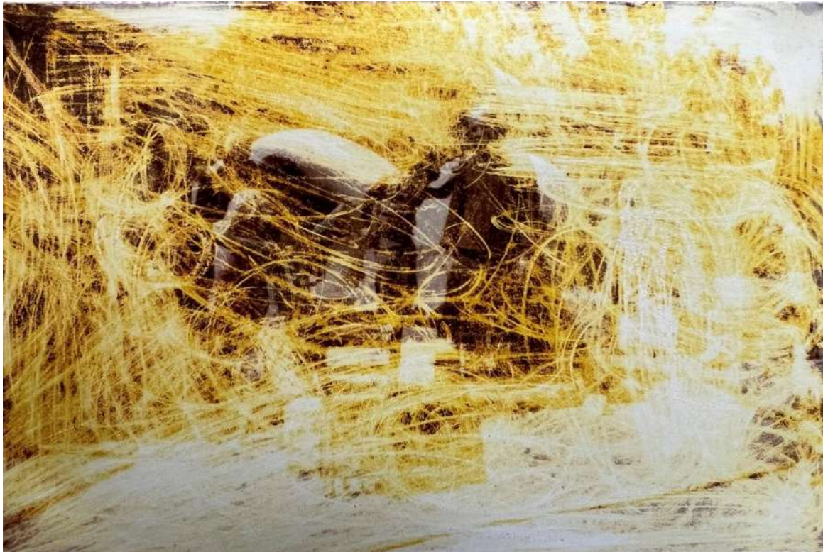
Untitled, 2022, photograph, 15 x 10 cm